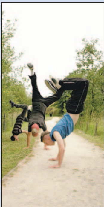
JUMP TO IT Dancers from Tibshelf Community School practicing prior to their cave performance as part of Shine Week at Creswell Crags in Nottinghamshire.

The inspirational setting of historic Creswell Crags provided the back-drop for "The Meadows" - an ambitious week-long festival of creativity featuring over 800 talented pupils from 24 schools all over Bolsover, Ashfield and Mansfield engaging in a number of different activities including dance, art and creative writing.